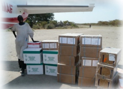
Emergency air supply for the bush clinic!

With my 21 cartons of SSG (Sodium-Stibogluconate), each containing treatment for 15 adults or up to 75 children, I had saved some 1000 persons on that very day through my flying service: Every