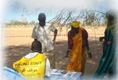
Polling "room" under a tree