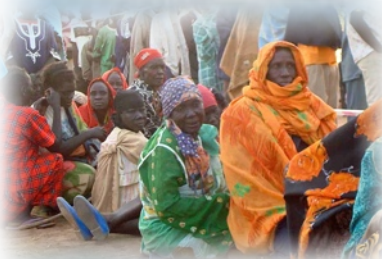
patient, peaceful waiting

2005, after decades of civil war, a comprehensive peace agreement (CPA) for 6 years was implemented, which should temporarily settle the fights between Northern and