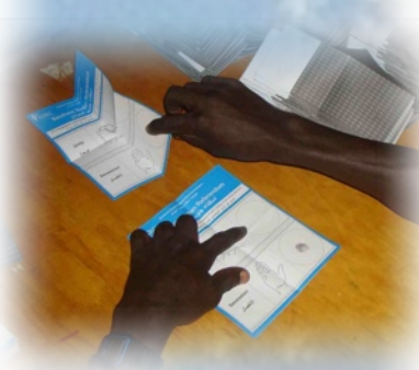
Paper ballot ...

Due to turbulent months, I haven't managed to write many Diary extracts for my website recently. They will follow soon.